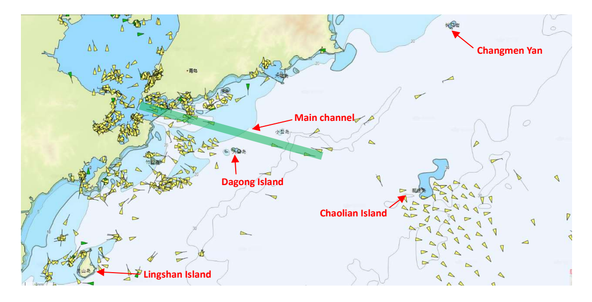
An illustration of key navigable waters