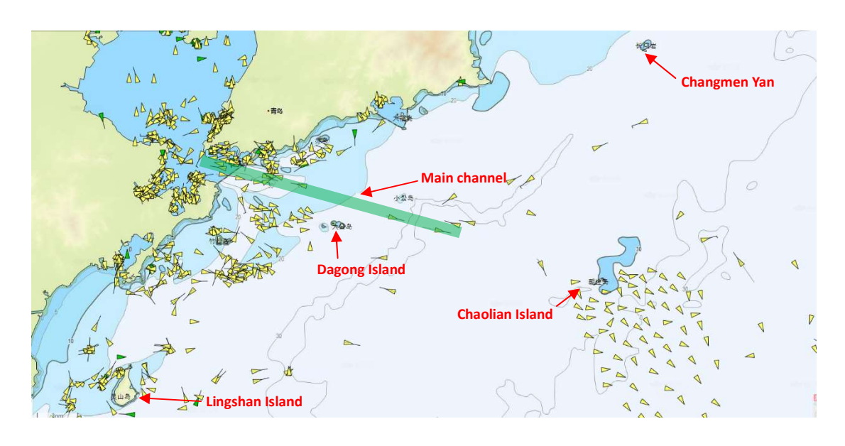
An illustration of key navigable waters