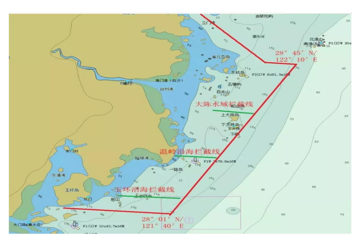
High Risk Areas in Taizhou Coastal Waters