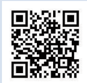
Japan Coast Guard Twitter