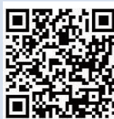
Japan Coast Guard Instagram