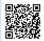
Japan Coast Guard YouTube