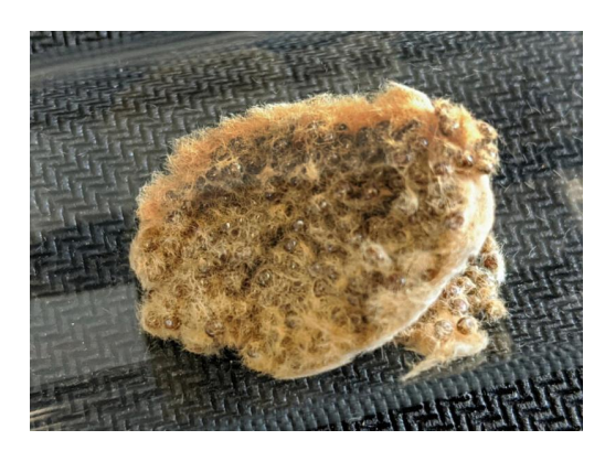
Egg mass of the highly invasive and destructive Asian Gypsy Moth.