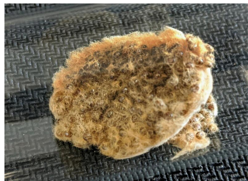
Egg mass of the highly invasive and destructive Asian Gypsy Moth.

“Vehicle carriers are large ships, so inspecting them is a tremendous task for Customs and Border Protection agriculture specialists, but a very necessary mission to protect our regional agricultural industries from destructive, invasive pests,” said Casey Durst, Director of Field Operations for CBP’s Baltimore Field Office. “CBP remains steadfast in our commitment to vigilantly protect our nation’s agriculture every day against the extraordinary threat posed by invasive insects and highly pathogenic animal and plant diseases that threaten our economic security.”