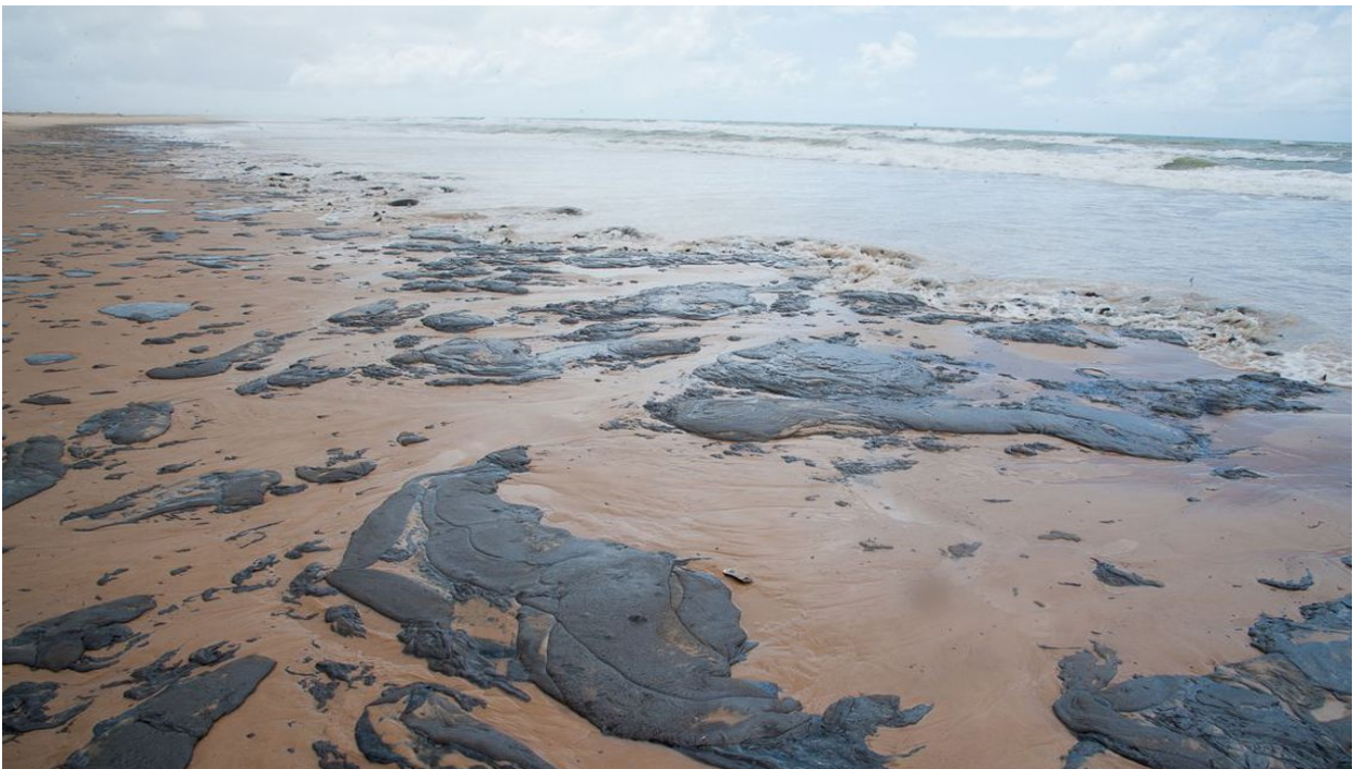
Crude oil washed upon a beach in the state of Pernambuco

A study by the Institute of Geosciences of the Federal University of Bahia (UFBA), in partnership with the Federal University of Sergipe (UFS), points out that the oil is of Venezuelan origin. The information was released by the director of the entity who said that the analysis of samples collected off the coast of Bahia and Sergipe showed the presence of carbon and biomarkers similar to the crude produced in Venezuela.