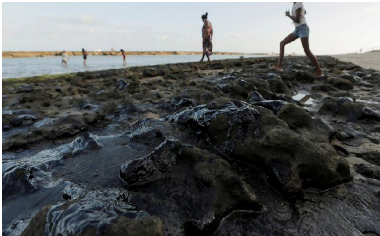
Lumps of crude oil washed on the shores of the State of Bahia

To date, more than 130 tonnes of oil waste has been collected on the many affected beaches, while oil-soaked sea turtles are being washed on the shores of the northeastern coast, many of them already dead. Fish contamination and mortality are also being reported.