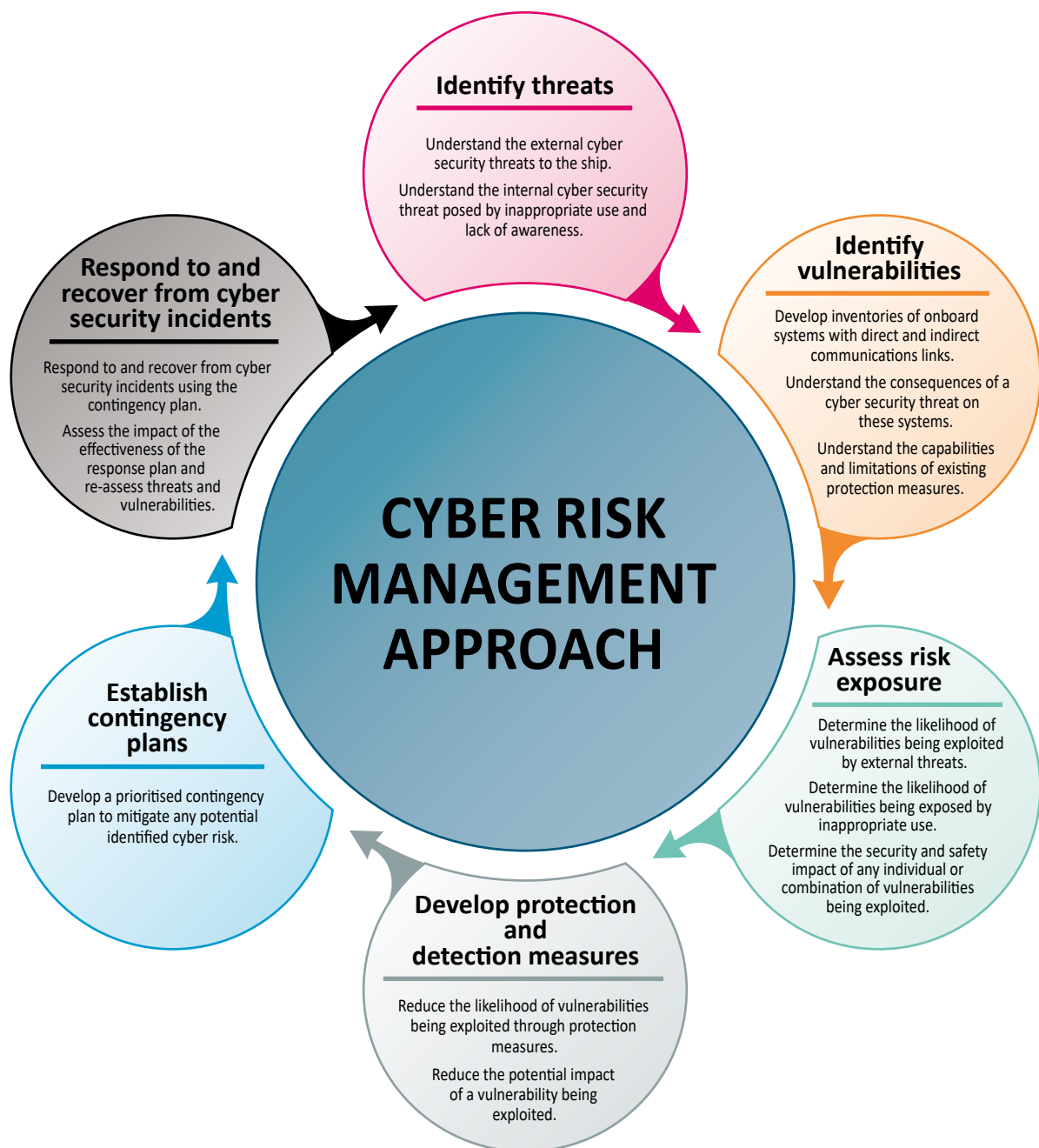
Figure 1: Cyber risk management approach as set out in the guidelines

Some aspects of cyber risk management may include commercially sensitive or confidential information. Companies should, therefore, consider protecting this information appropriately, and as far as possible, not include sensitive information in their Safety Management System (SMS).