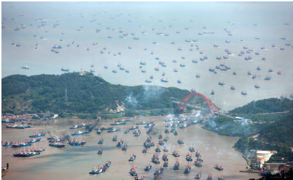
Fishing boats are proceeding to the fishing farms after fishing ban ends

Apart from the fog season in March and April, the period between August and October is another high-occurrence season of collision incident with fishing boats. Viewing the above, ships are suggested to pay more attention in the subsequent days immediately after the fishing season starts.