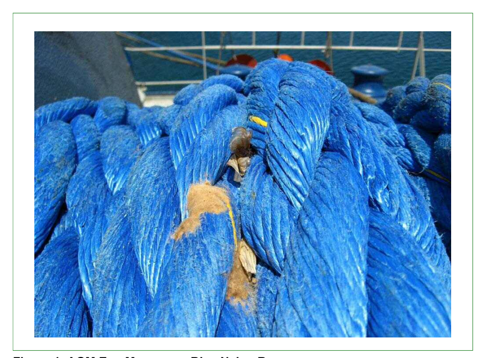
Figure 1 AGM Egg Masses on Blue Nylon Rope

See Figure 1 for a photograph of AGM egg masses aboard a ship. The egg masses appear as brown fuzz on the blue nylon rope. Figure 2 illustrates AGM eggs found between two bays on a support beam near a cargo hold opening.