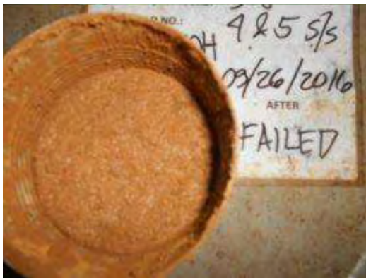
A failed test – flat pancake appearance- - FAIL carry out laboratory analysis of cargo

This is a simple test and as the term implies (can test) a metal can is suitable, such as a coffee tin, paint tin (but must be clean). Take about 1 to 2 kg of the ore and place it in the tin, repeatedly slam the can the bulk code says 25 times, if the ore remains the same then there are no obvious signs of moisture, if it shows any signs of liquefying (very obvious will be where free water appears on top or takes on a shiny flat appearance ) then the cargo should be rejected and not loaded .