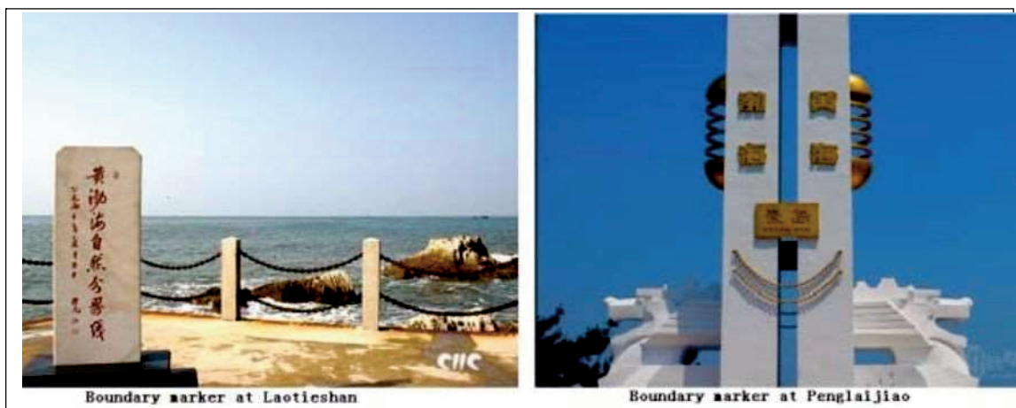
Boundary marker at Laotieshan

According to the Declaration by the Government of People’s Republic of China on the Territorial Seas, Bohai Bay is the inland sea of China.