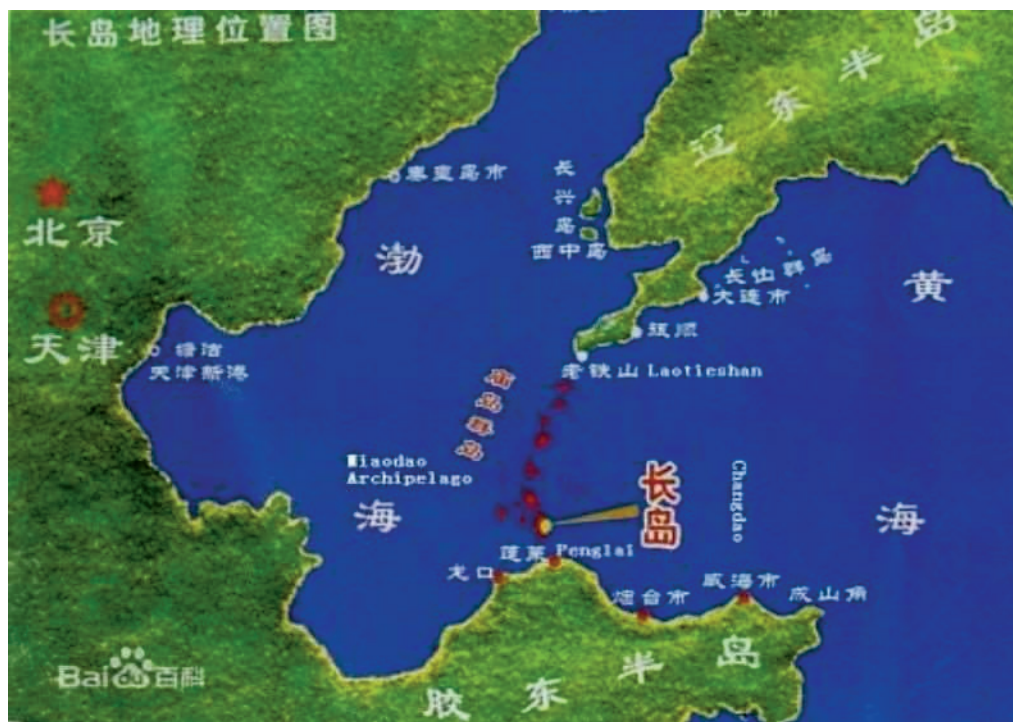
location map of Bohai-sea

The separating line between Bohai Bay and Yellow Sea is the line (marked in red in below map) from the west corner of Lao Tie Shan(approximately 38°43.663N, 121°08.082E) located in the south of Liaodong peninsula to Peng Lai Jiao (approximately 37°49.931N, 120°44.575E) located in the north of Shandong peninsula via Miaodao Archipelago.